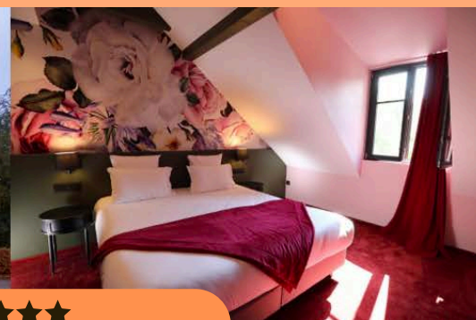
Hôtel Le Moulin ★★★★★

From 338,72 € for one night in a double room, 2 breakfasts, tourist tax and 2 green fees at the Wantzenau golf course.