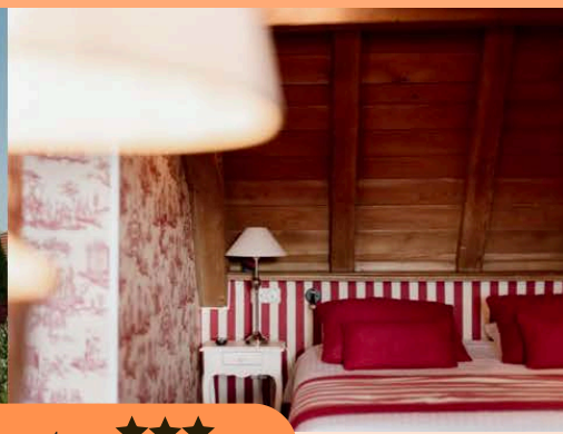
Hôtel Le Relais de la poste ★★★

From 304,24 € for one night in a double room, 2 breakfasts, tourist tax and 2 green fees at the Wantzenau golf course.